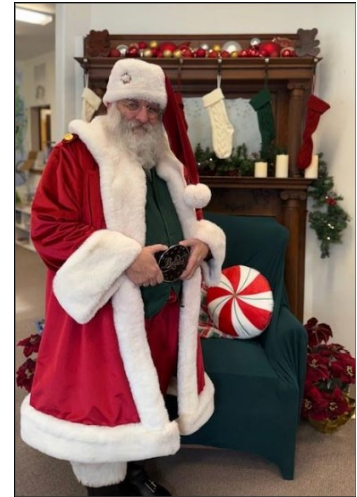
Rockwell Falls Public Library

Galway Public Library started a new service, a monthlong wrapping station for community members to wrap gifts using donated wrapping paper, bows, etc.