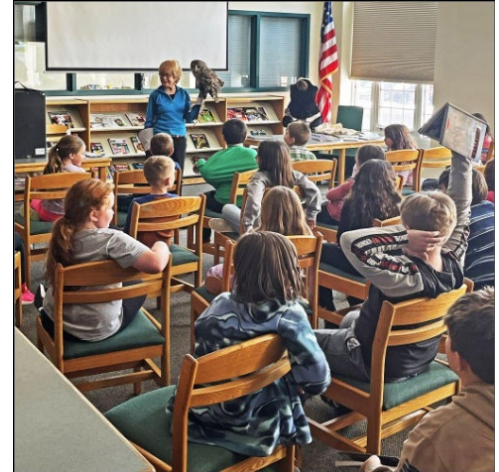
Bolton Free Library Wildlife & Literacy Program