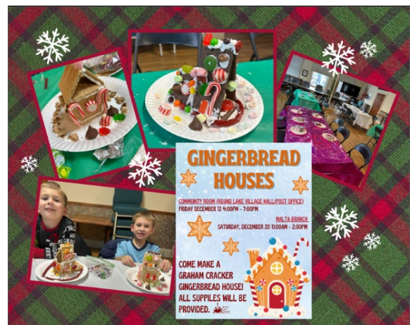
Round Lake Library and Malta Library

The Johnsburg Free Library was featured in The Sun Community News for the support and services they provide to the North Country community, highlighting their regular programming such as Family Movie Night, Trivia Night, and Sound Bath Meditation.